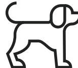
MAXIMUM WEIGHT 15 KG